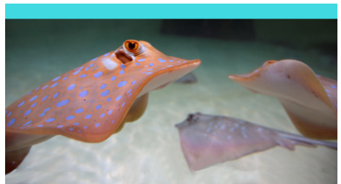
The Blue spotted pink Manta Ray

Discover the Sunshine Coast, the world famous Australia Zoo. including the award winning living legacy of the Crocodile Hunter, Steve Irwin. You'll see crocodiles in action in the Crocoseum, cuddle an adorable koala, hand-feed Asian Elephants or even walk with a Sumatran Tiger.